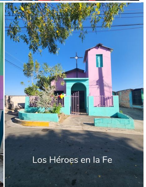
Los Héroes en la Fe