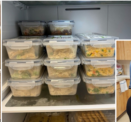
Meals are in the kitchen freezer.